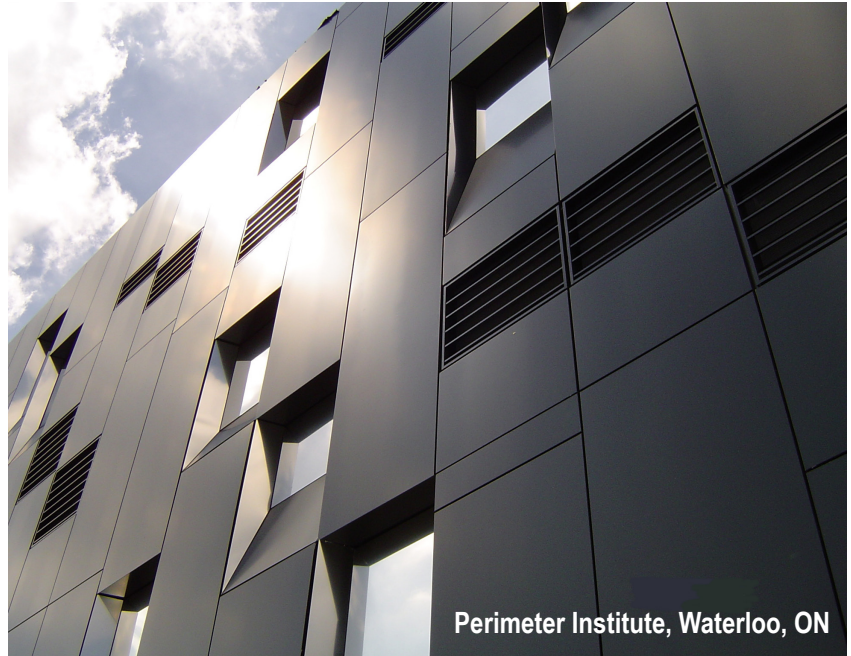
Perimeter Institute, Waterloo, ON

Exterior or interior wall panel for new construction, renovation, commercial and various other applications. Some typical uses include; exterior wall panels, fascia panels, ceiling panels, spandrel panels, beam & column covers, wall trim, accent panels and signage.